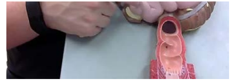
How To Entirely Empty Your Bowels Each Morning (1 Min Routine) wellnessmed.net | Sponsored