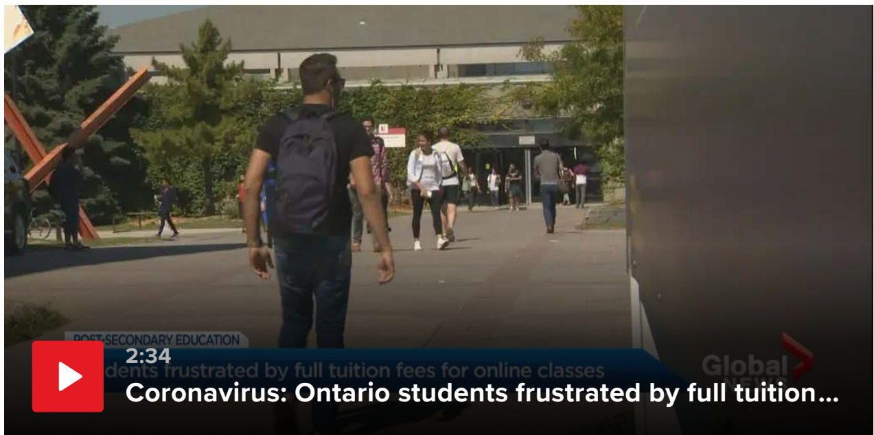
Coronavirus: Ontario students frustrated by full tuition fees for online classes

Sova is among many Ontario university instructors gearing up to offer students courses revolving around the COVID-19 pandemic this upcoming school year.