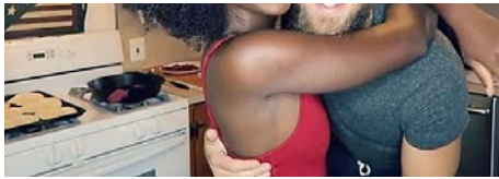
[Pics] Couple Are Confused Why Their Pic Is Going Viral but Then They See Why gnarlyhistory.com | Sponsored