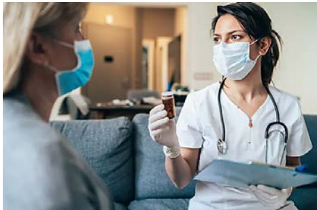
Asked to submit to an independent medical assessment? Here's what...