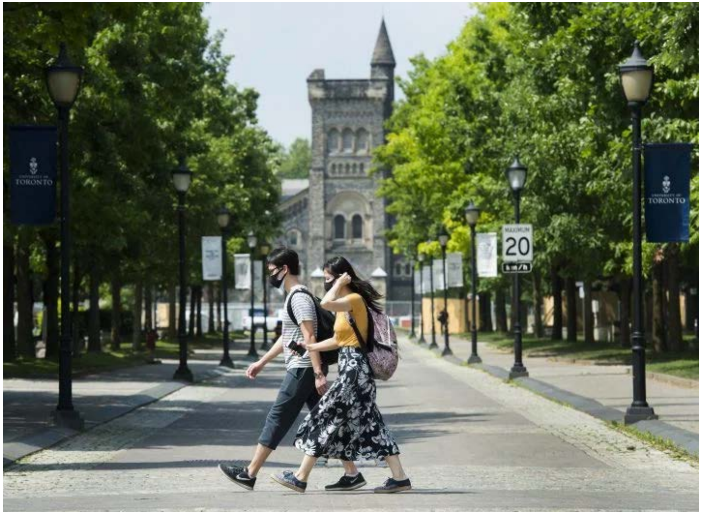
People walk past the University of Toronto campus during the COVID-19 pandemic in Toronto on Wednesday, June 10, 2020.