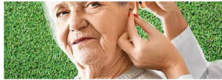
Over-55s in Ontario Eligible For Invisible Hearing Aids Connect Hearing | Sponsored