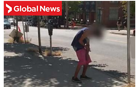
More Vancouver residents sound alarm about deteriorating downtown core