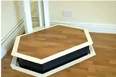
Stair Elevators Could Be A Dream Come True For Seniors in Toronto Stair Elevators | Sponsored Listings | Sponsored