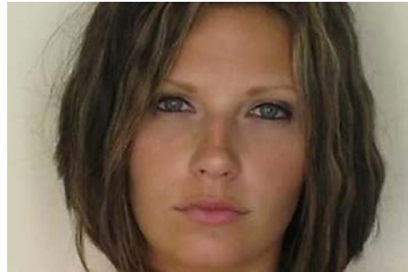
The Most Successful Lawyers in Toronto: See The List Lawyers | Search Ads | Sponsored