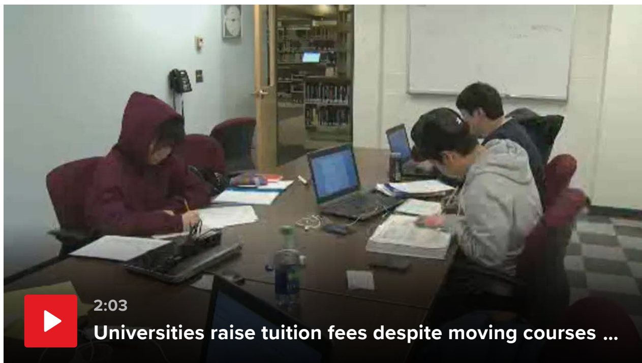
Universities raise tuition fees despite moving courses online