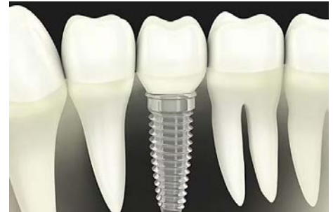
Here's What New Dental Implants Should Cost in 2020 Dental Implants | Sponsored Listings | Sponsored